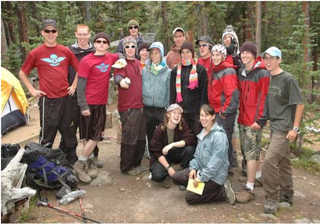
Cadets, instructors and mountain guides relax at Cathedral Provincial Park in September.

Cadets were challenged individually and as a group to improve their skills in decision-making and problem solving, teamwork and co-operation, communications, tolerance, resourcefulness and time management. Seven mountain peaks with an average altitude of 2,550 meters were climbed. The outdoor adventure also teaches personal safety, environmental stewardship and encourages a healthy lifestyle.